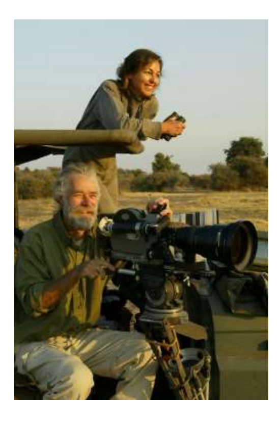
Have you had to alter your approach to filming to coincide with the preferences and tastes of your viewing public?

No. We work on the basis that we are 'scouts' in many ways, bringing to the public or audiences the way we see things from years of field time. If we adjust that in a way to what people want to hear, (or not hear) then we fail and just become providers of pretty pictures. All our films have a conservation message and core. That isn't always popular but it's important to who we are and what we do this for. Sometimes it's a debate with a network or broadcaster about what the public can stomach, but 9 times out of 10 we win the battle based on the argument that audiences are generally more intelligent than TV executives give them to be, and it's our mutual responsibility to deliver the truth or as close to reality as the medium allows, (delivering a 3 year story in one hour.).