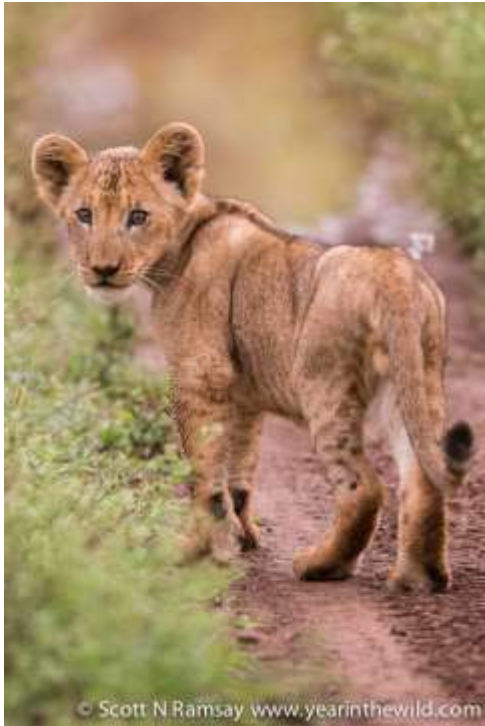
Lion cub in Hlane Royal National Park