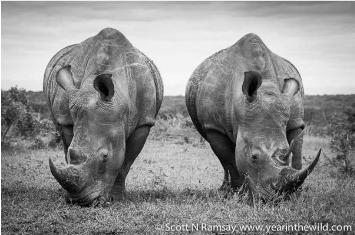
Up close...at Mkhaya Game Reserve and Hlane Royal National Park, it's possible to get up close to white rhino, which in Swaziland are habituated to vehicles and the rangers.