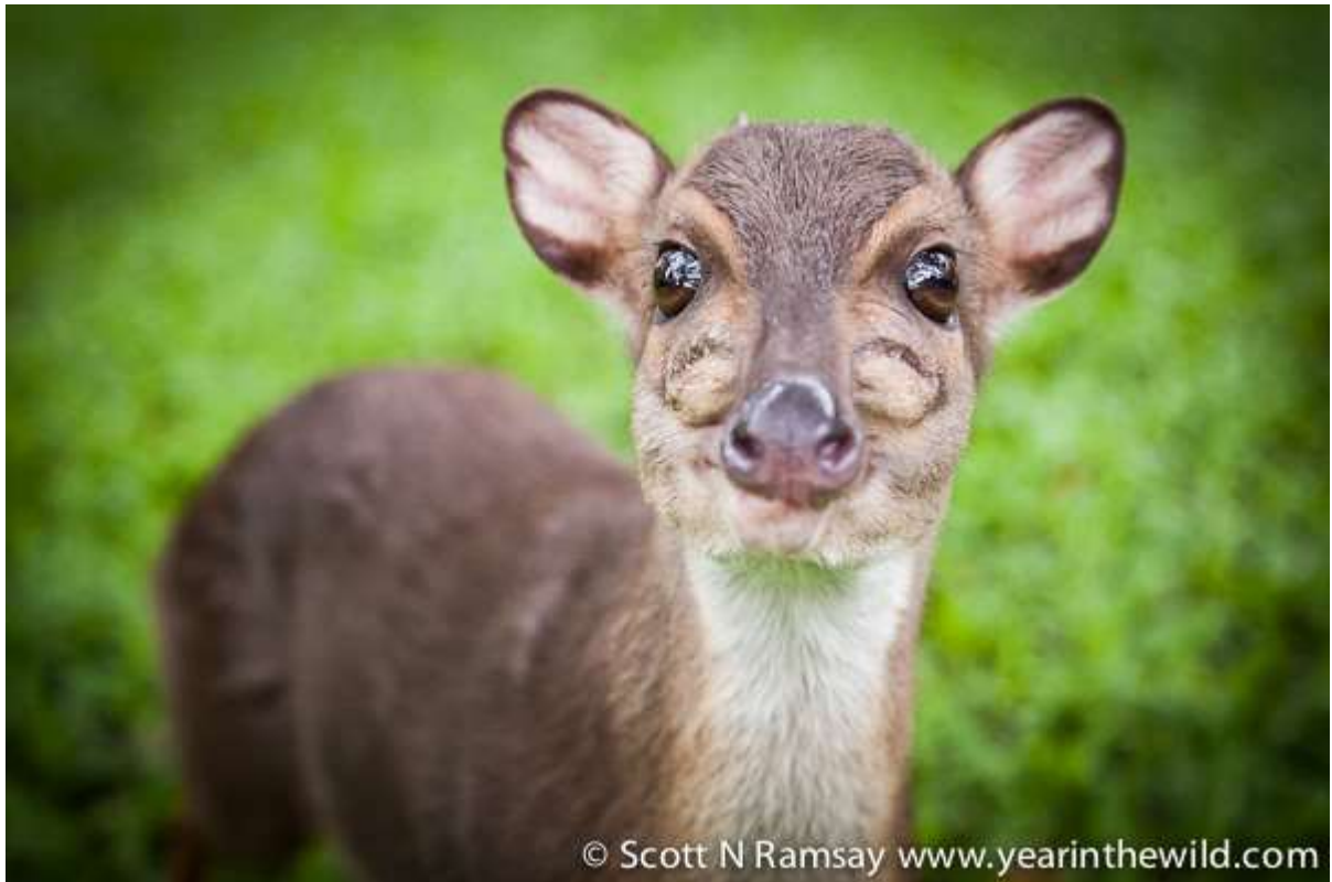
A blue duiker at Mlilwane...the second-smallest antelope in Africa