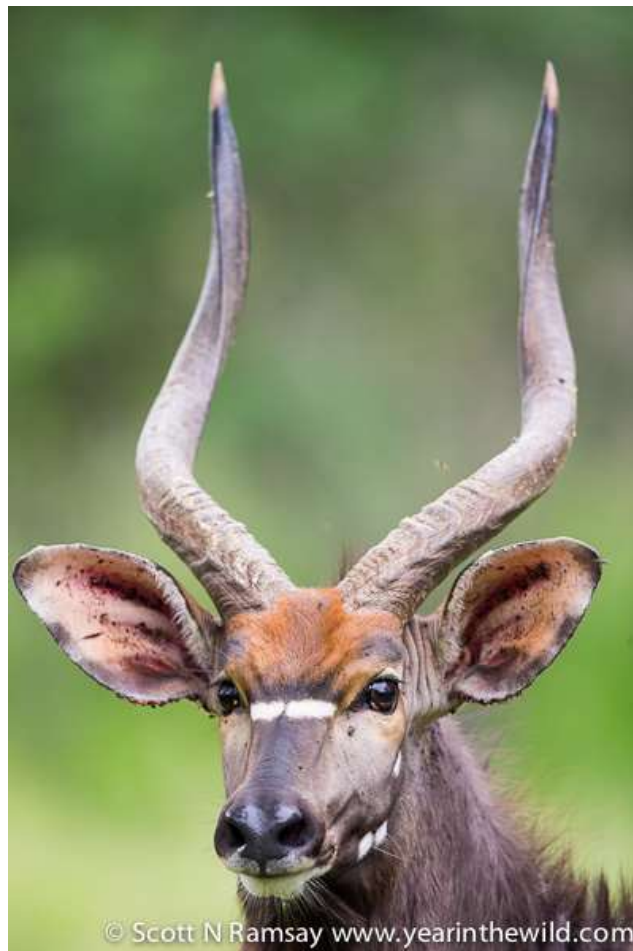
A beautiful male nyala antelope in Mkhaya Game Reserve