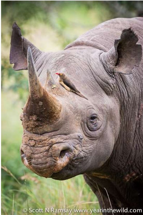
Black rhino and red-billed oxpecker at Mkhaya