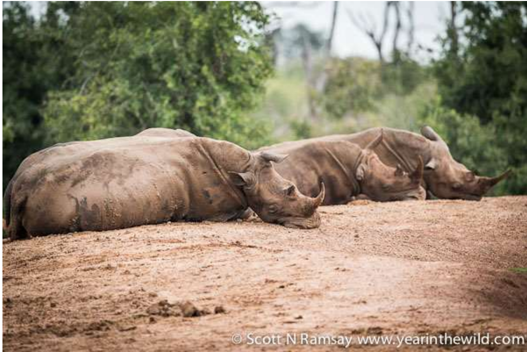
Chilling by the pool...white rhinos laze about near the waterhole at Hlane Royal National Park