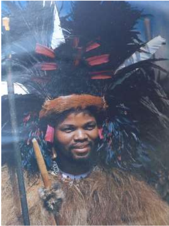
King Mswati III, who continues to support Big Game Parks' conservation efforts in Swaziland