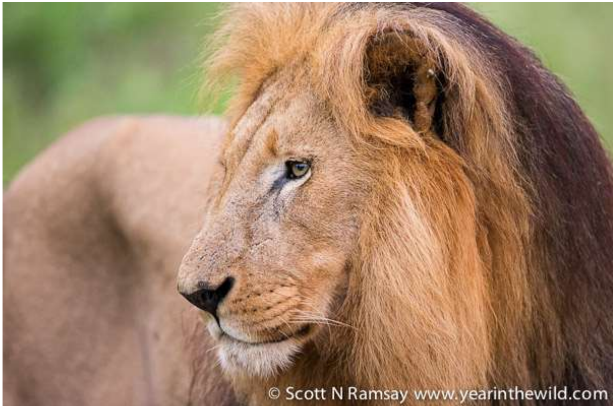
A male lion in Hlane Royal National Park