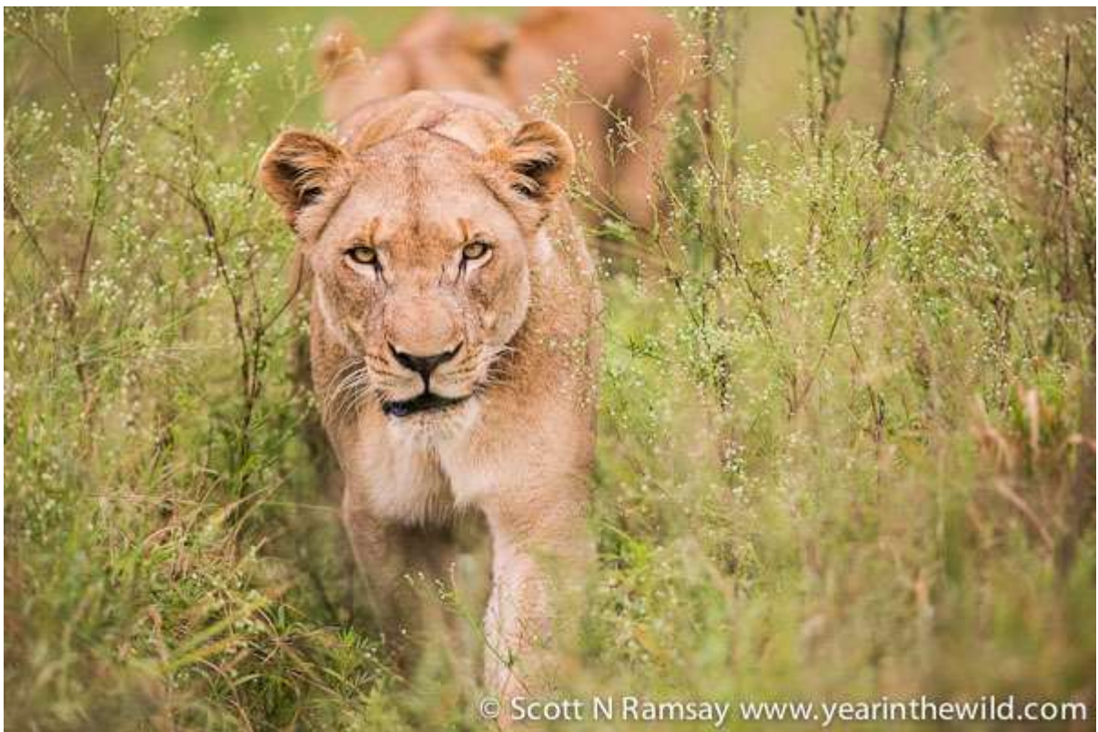
On the prowl...a lioness leads the way on a hunt in Hlane Royal National Park