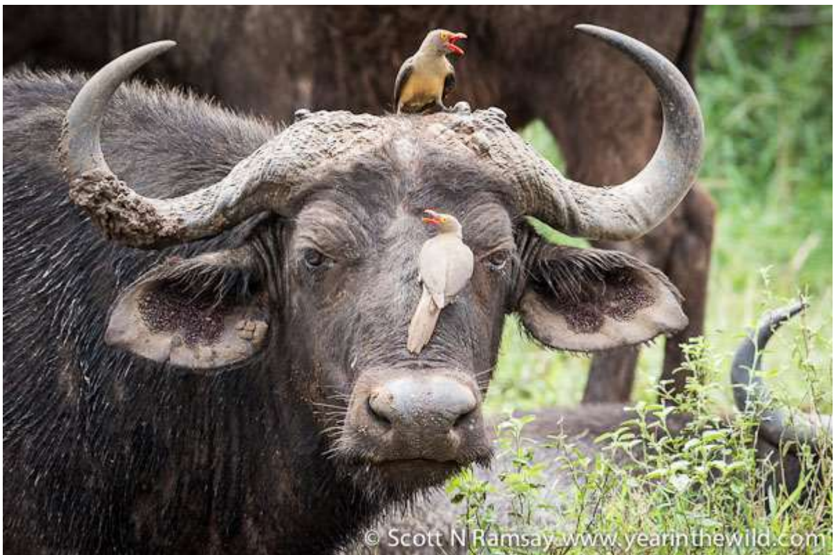
Buffalo and red-billed oxpeckers at Mkhaya Game Reserve...