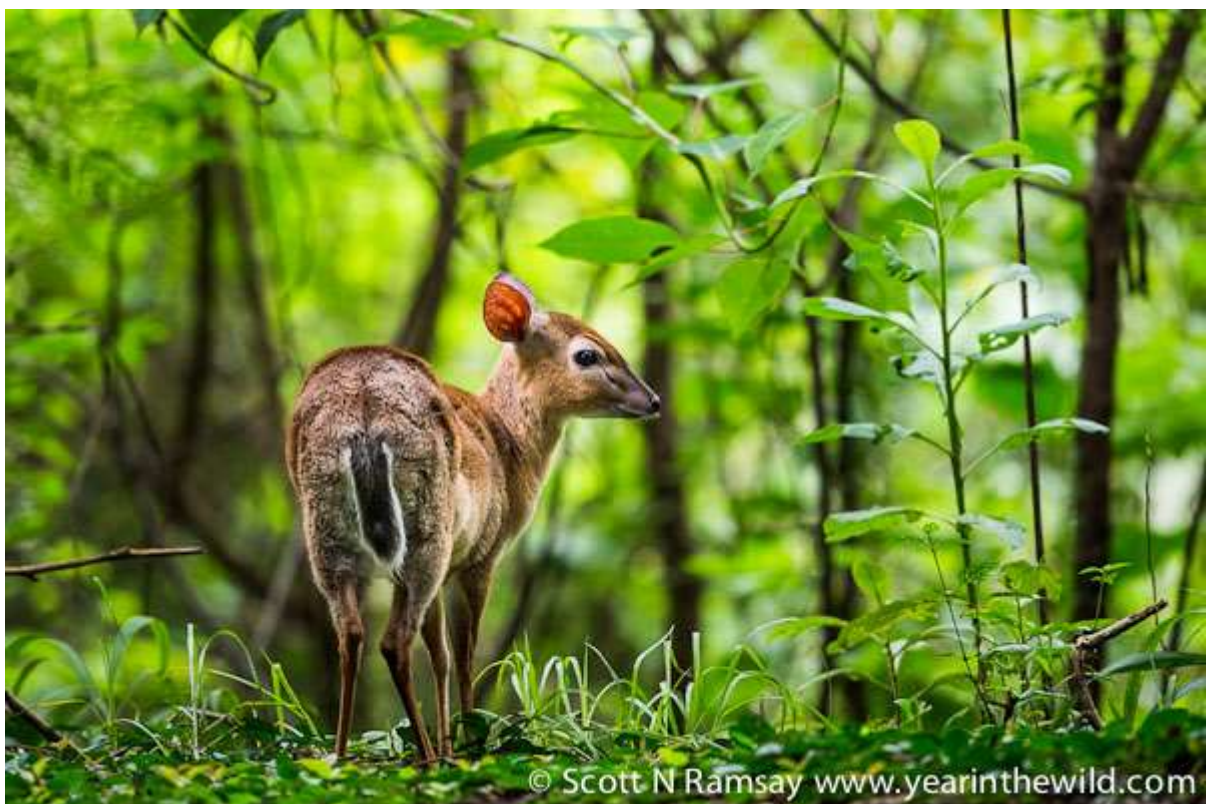
A suni antelope, another rare species found only in the forest regions of the south-eastern parts of Southern Africa