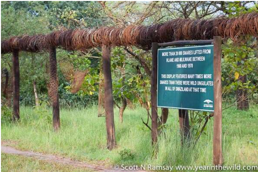
Thousands of snares were collected from the veld in Mlilwane, Hlane and Mkhaya. At one stage, these snares outnumbered the total number of wild animals several times over. These snares are on display at Mlilwane.