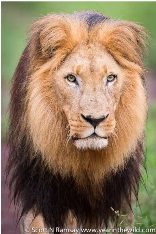
After being hunted to local extinction in the mid 1900s, the lion is back...in Swaziland, it is the symbol of the king. This photo taken at Hlane Royal National Park.